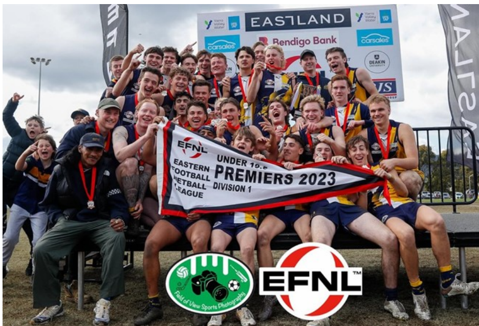
Our 2023 Thirds premiership team.

You can keep up with all the Beacy footy news on our Facebook page and we would encourage you all to get involved with your community club in 2024 whether it's with the Juniors or Seniors but it is great place to form life long connections and friendships.