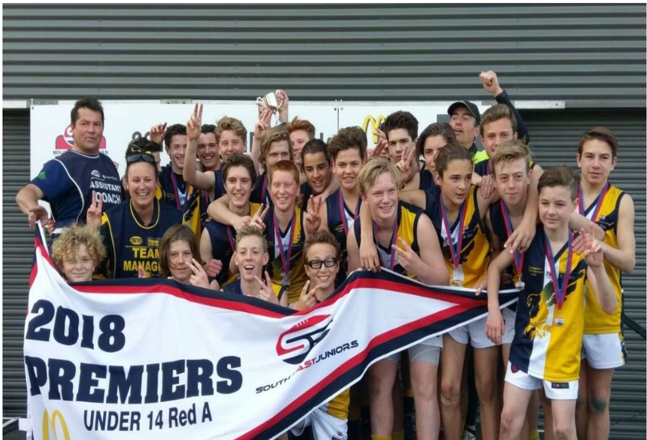
Premiership winners – Beaconsfield U14 Blue