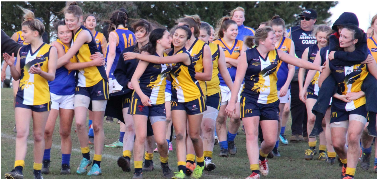
Youth Girls (U16 team) celebrating their Preliminary Final win against Cranbourne securing a spot in the Grand Final