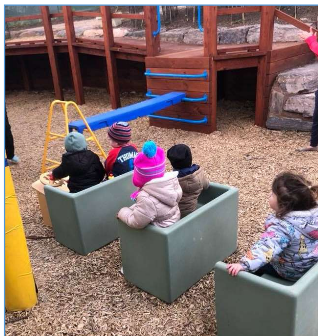
Our Playgroup kids rugged up for their "bus ride".

Our Playgroups are very popular, and most sessions are now full with waiting lists. Limited places may still be available this year so please do register your interest.