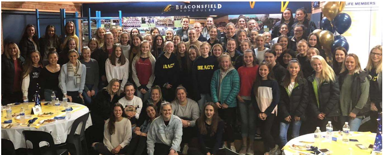
Beaconsfield Netball Club Annual Finals Dinner