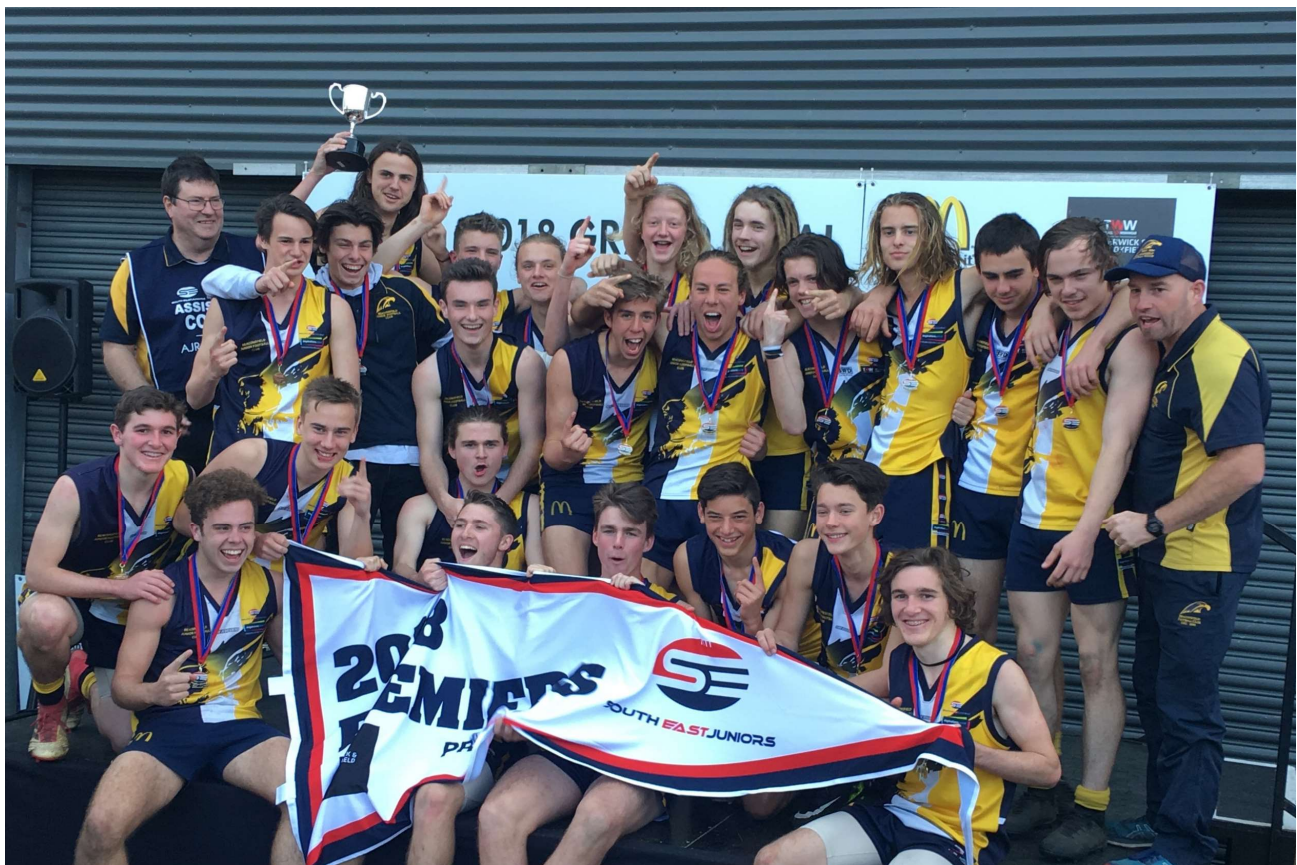
Premiership winners – Beaconsfield U17 Blue – Division 1