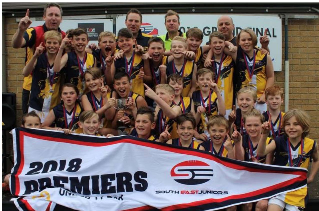
Premiership winners – Beaconsfield U11 Blue