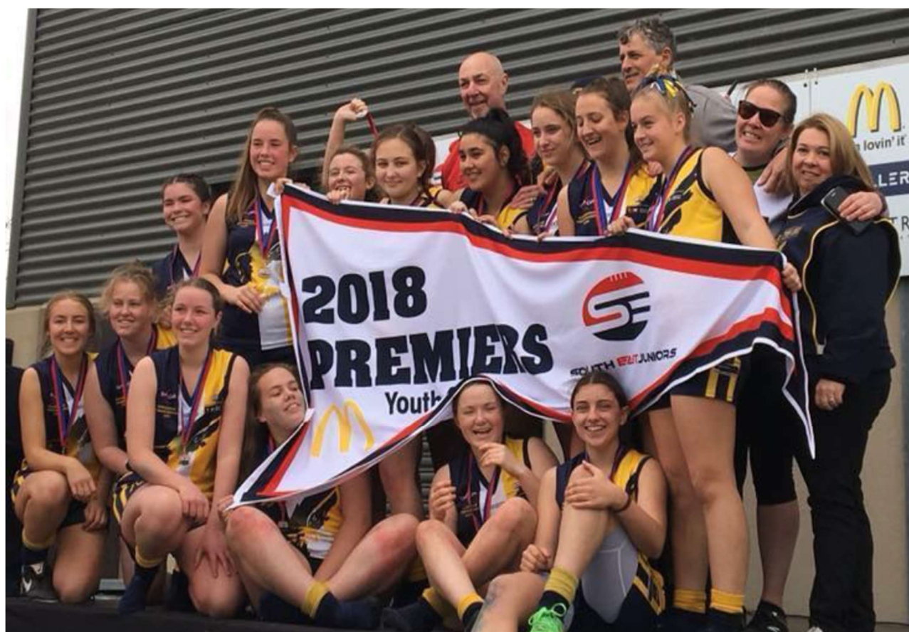
Premiership winners – Beaconsfield Youth Girls U18