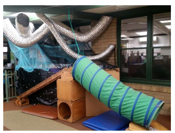
Woods St spaceship PMP course

Our children have also been busy preparing special gifts for their dads for Father's Day. All fathers/special persons were invited along for an evening of kindergarten fun either just before or just after Father's Day.