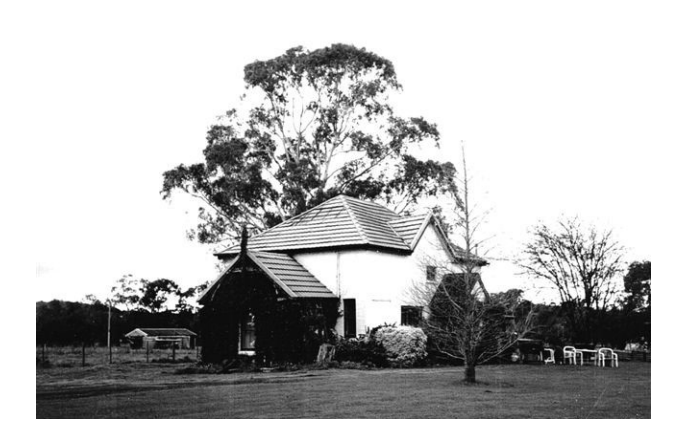
Old coach house

amount of money, in the shape of capital and deposits, is locked up, and the income accruing from it ceased, partly because paralysis inevitably fell upon the market in real estate, and partly because colonial depositors taking alarm have for some time past been drawing out faster than the British depositors paid in. Among the Melbourne companies that sunk in early 1892 are the Freehold Investment and Banking Co, the Victorian Mortgage and Deposit Bank and the English and Australian Mortgage Bank. The collapse was a 'domino effect' bringing an end to the boom of the 1880's".