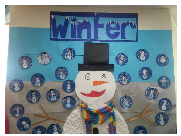
Diamond and Sapphire room artwork

Beaconsfield Kindergarten still has places available for 2018 at both campuses. If you're still undecided about where your child will go to kinder next year, or you just want to look at some other options, please give us a call. We welcome families to come along and do a tour at a time that is convenient for you, and are happy to answer any questions about our service and the programs offered.