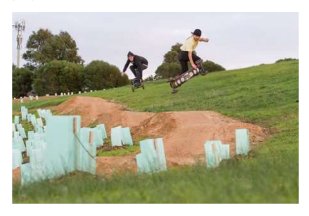
For a full presentation of proposed Track, visit www.australianmountainboarders.com