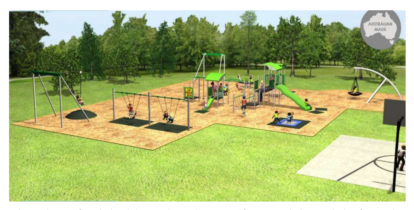
Indicative drawing of ONeil Rd Oval Playground Upgrade – extracted from Omnitech Playgrounds plans for council. Refer Ranges Ward Councillors' Report article.