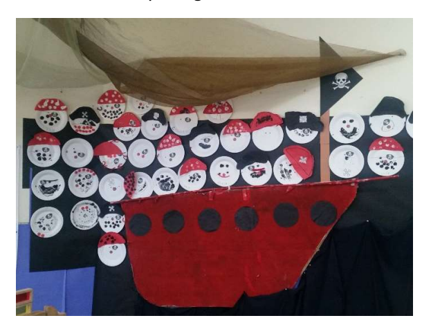
Jade and Opal room artwork

Our O'Neil Rd groups took part in a yoga incursion run by South East Yoga and Wellbeing. The yoga sessions commenced with a story being read, and then the children retold the story using movement, noise and physical poses, with a focus on movement of the body. The sessions concluded with a relaxation experience in which the children closed their eyes and listened to a story being read.